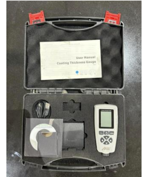
Digital DFT meter