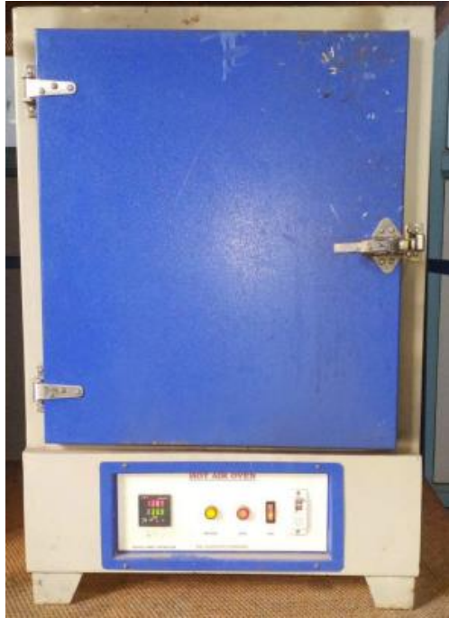
Hot Air Oven With Digital Timer