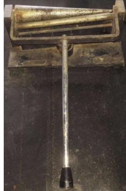
Conical mandrel for flexibility Test