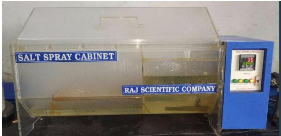
Salt Spray Machine

List of instruments required for high performance and accelerated environment in our LAB.