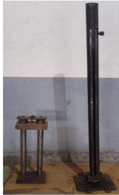
Tubular Impact Tester