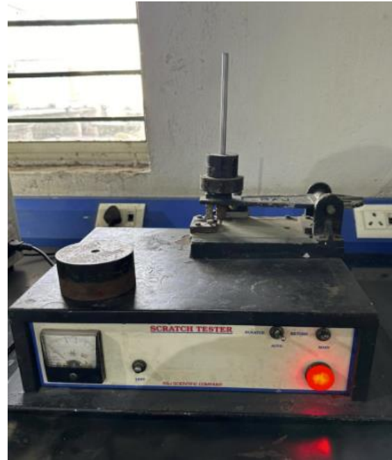
Scratch hardness tester