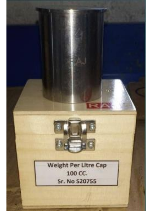
Weight Per Ltr Cup